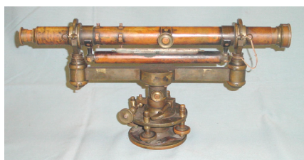
LV 29, 18-inch Engineer's Wye Level, Stackpole & Brother, New York, S/N 684, c. 1867.

telescopic level preferred by American engineers for about 120 years and was still being produced into the second half of the 20 th century. The telescope is 17 inches long in the closed position and the spirit level is 8 inches long. The support base is engraved in script W.J. Young, Maker, Philad a . The cross hair reticle has two horizontal hairs and one vertical. It comes with the original wood case but there is no leveling base nor tripod. This oral history accompanying this instrument is that it is the first wye level produced by Young although written documentation is lacking. The American pattern wye level was developed in the late 1820's by William Young according to the article by Silvio Bedini "The Telescopic Level in Early America," published in Rittenhouse Journal, Vol. 11, Issue 44, August 1997, p. 109-123.