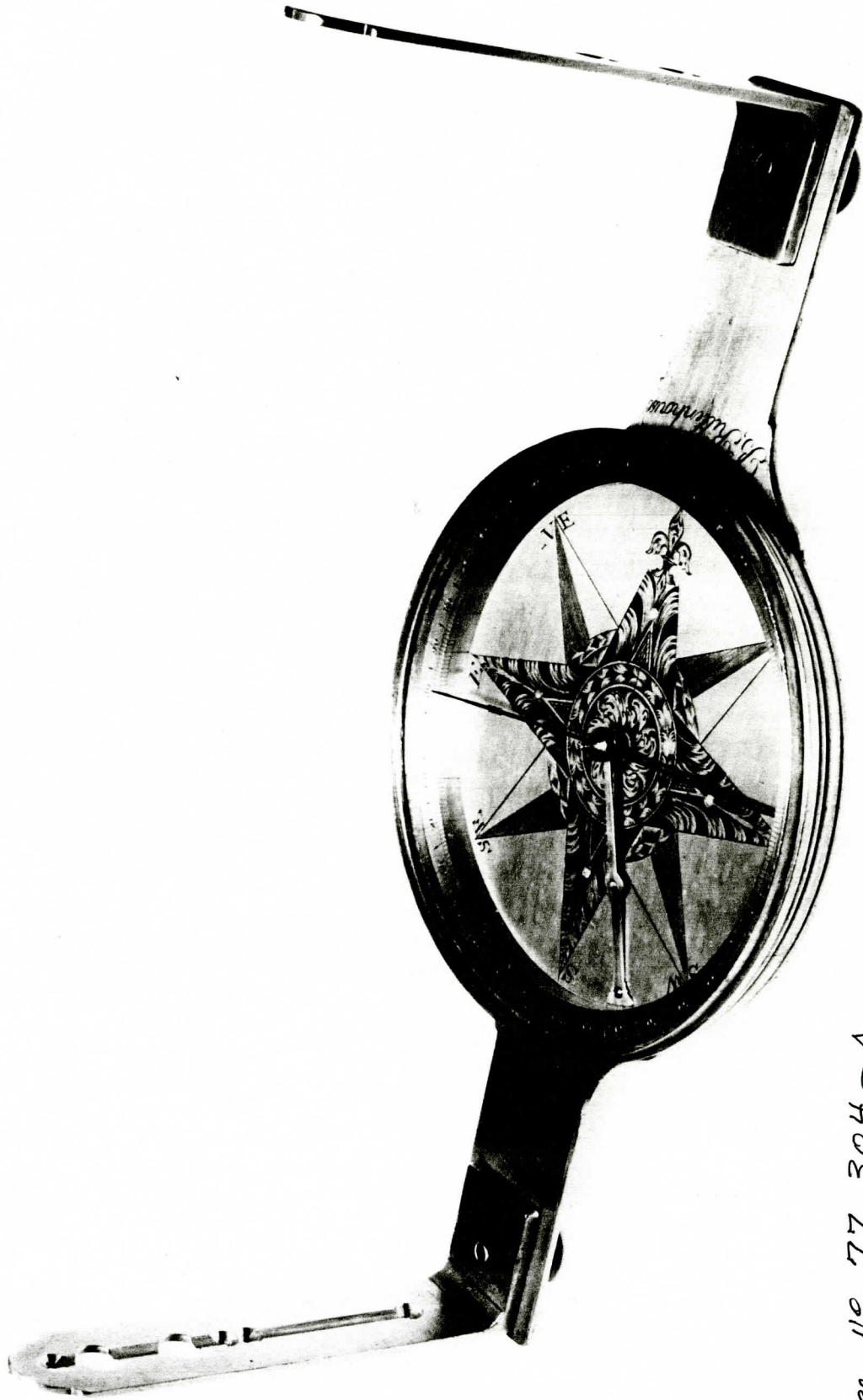
Neg. No. 77, 304-A cat. No. 310, 815 Surveyor's Compass by B. Rittenhouse