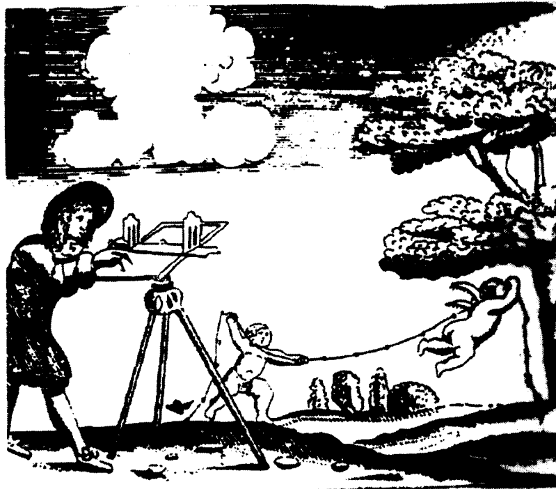
Illustration from The Compleat Surveyor by William Leybourn

An Offering of Fine and Rare Surveying Books