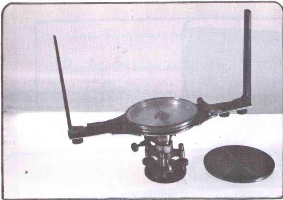
Su 86 Gurley Surveyors compass, all brass, with brass lid that fits over the compass and complete in original fitted wood carrying case. 5" Dia. dial, length 15", vanes 7 \frac{3}{4} " high, card marked W. & L. E. Gurley, Troy, NY, with cross levels. The unusual feature of this instrument is that it has its own levelling device, 4 screw, somewhat like on a transit whereas most of these old compasses had only a jacobs staff or simple tripod mount. This base is original as it fits in the box and is an integral part of the instrument. $500