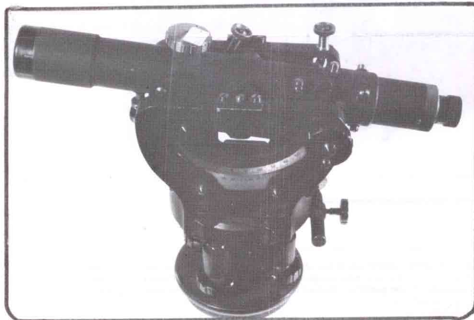
Su 92 Builders Transit/Level Vertical and horizontal scales with level under the telescope. Telescope is 12" long and internal focussing. It locks at level and has a release for measuring vertical angles. Scale is from 0 to 50° of elevation or depression, with vernier in 1' intervals 0 to 60. Made by Seiler Inst. Co. St. Louis, Mo., tripod mount, without box. $450