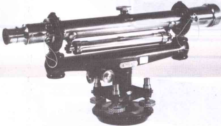
Su 91 Wye Level by C.L. Berger & Sons, Boston, Mass. Telescope is copper with brass fittings 17½" long. Complete in original fitted carrying case. Large level under the telescope. Internal focussing, with tripod mount. Clamps have retaining pins for removing telescope. $500

For those of you who visit our shop in person, we have moved two blocks down Severn Ave. We are now located on the corner of Second Street & Severn Ave. in the East-port section of Annapolis. Normal shop hours are 10-5 daily except closed on Sunday and Tuesday.