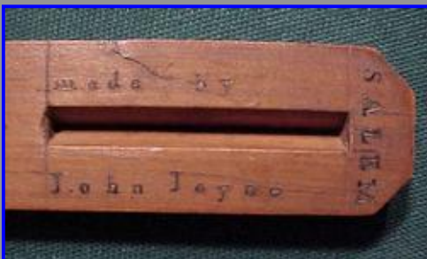
Click image to view larger version