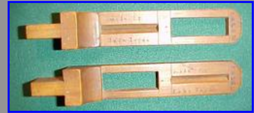
Click image to view larger version