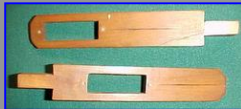
Click image to view larger version