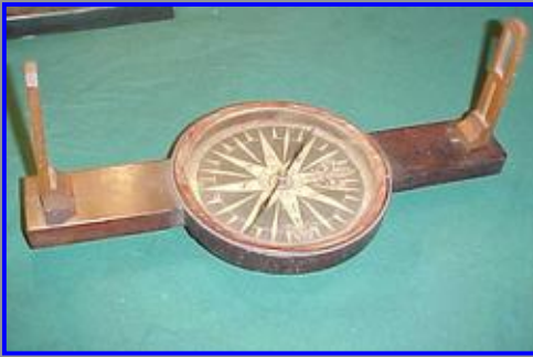
Click image to view larger version