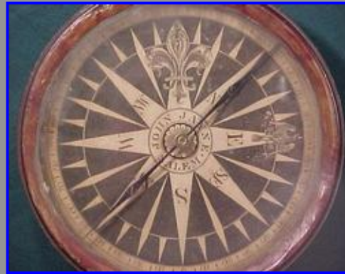
Click image to view larger version